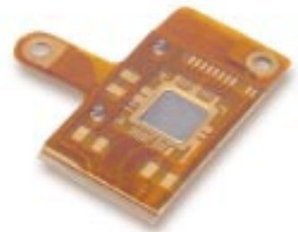
3-mil Lines on Flex with Aluminum Stiffener