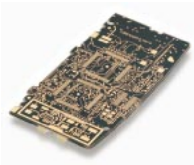
Soft Bondable, Hard or Immersion Gold