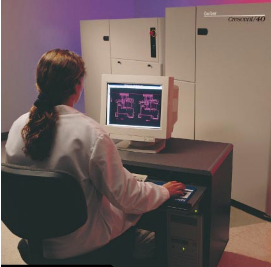
High-speed Gerber Crescent 40 Photoplotter