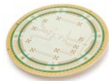
Rogers 4003 Multi-layer with Controlled Impedance